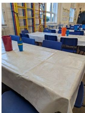
New tablecloths for lunchtime